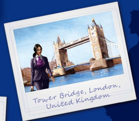
Tower Bridge, London, United Kingdom

Once you have read this far, you can play round 3 and round 4.