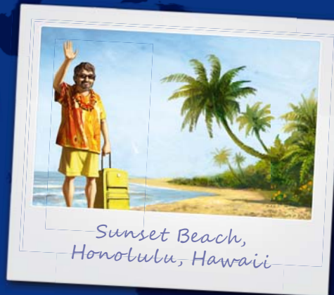
Sunset Beach, Honolulu, Hawaii