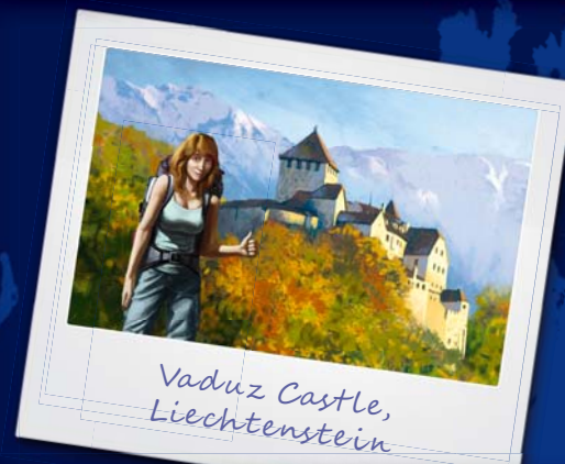
Vaduz Castle, Liechtenstein

Spring bursts into bloom, and so does the second phase of Project Boundless (rounds 3 and 4). The stipends are bigger, but the assignments are longer.