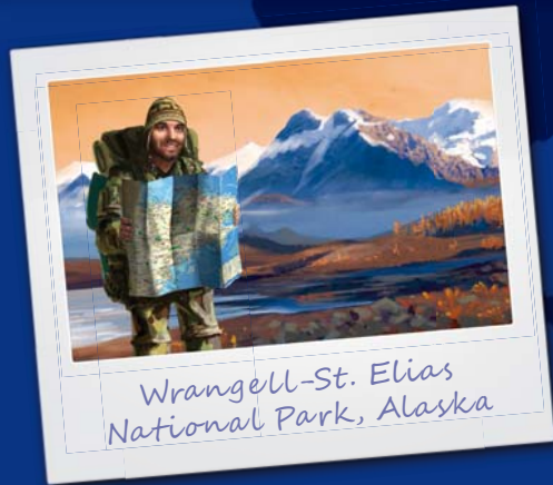
Wrangell-St. Elias National Park, Alaska